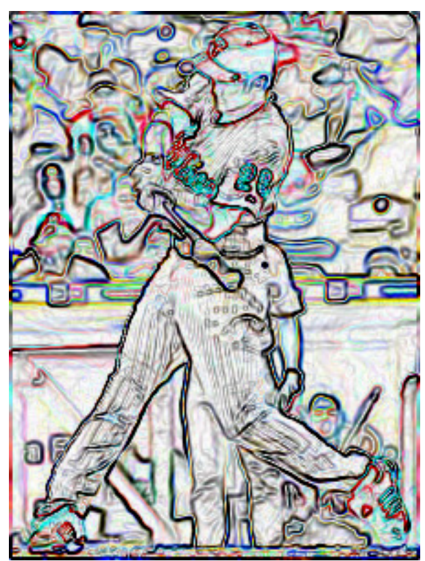
*Starting time for Home Run Derby will be determined based on number of entrants. Stay tuned to website for further details.

(e) Home Run Derby Showdown: The Entrants will hit in the same order as in the Championship Round. Each player will get one swing. If one Entrant hits a Home Run and the other does not, the Entrant who hits a Home Run is the Champion. If they both hit Home Runs or neither hits a Home Run, the process will continue until one Entrant hits a Home Run and the other makes an out.