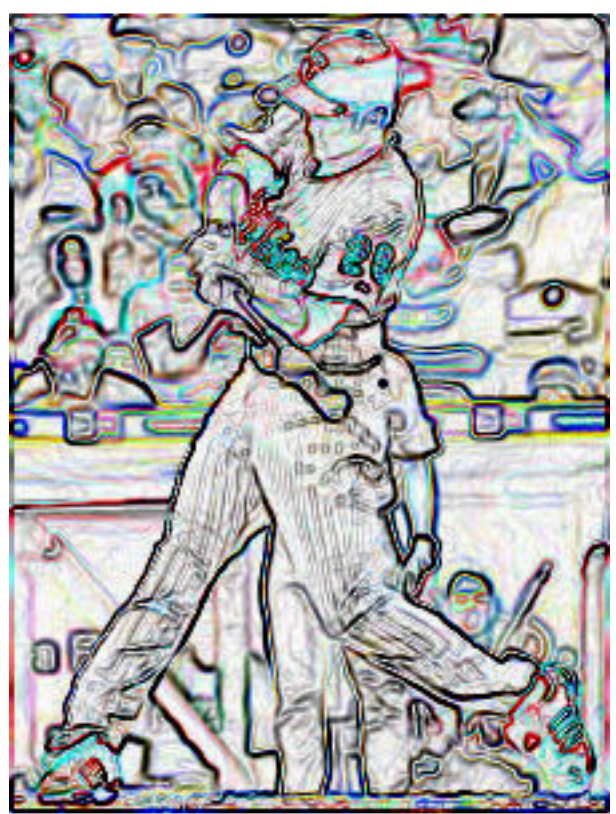
*Starting time for Home Run Derby will be determined based on number of entrants. Stay tuned to website for further details.

(e) Home Run Derby Showdown: The Entrants will hit in the same order as in the Championship Round. Each player will get one swing. If one Entrant hits a Home Run and the other does not, the Entrant who hits a Home Run is the Champion. If they both hit Home Runs or neither hits a Home Run, the process will continue until one Entrant hits a Home Run and the other makes an out.